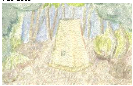
Walk to Trig point at Blackwater Hill to view Stour valley and Hurn Court House.