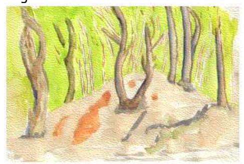
Walk to the top of the hill to examine the sites of tumuli.