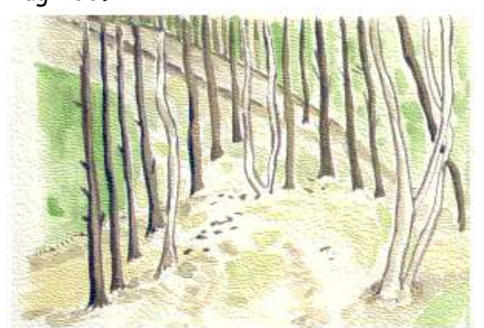
Walk along base of hill and then to southern viewpoint to view Purbecks.