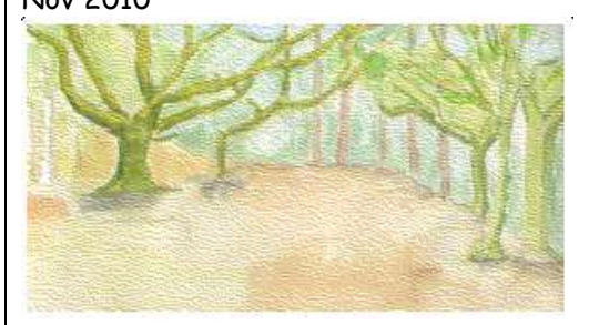
Walk to southern end of hill to note where Oak trees are to be found and examine their size and Age.