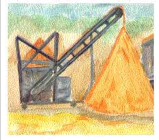
Walk to top of hill to examine how and where sand and gravel extraction took place.